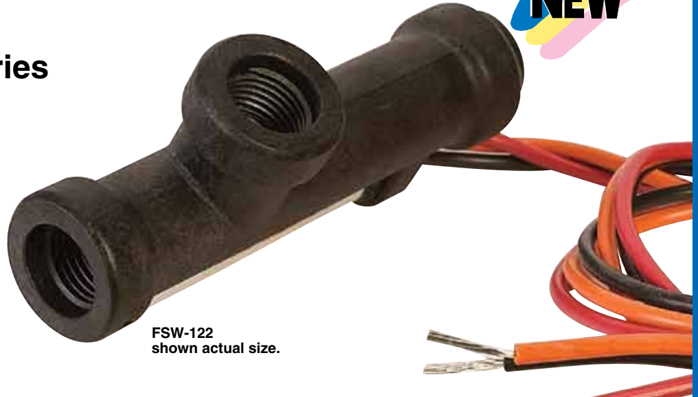
FSW-122 shown actual size.

The FSW-120 Series of compact PPS switches are ideal for use where space is at a premium. Designed for use with water and water based solutions, these switches are suitable for high volume OEM applications. They are ideal for coolant or chemical monitoring in portable equipment and many other applications with space constraints. The switch points are based on water flow, other liquids may require field testing.