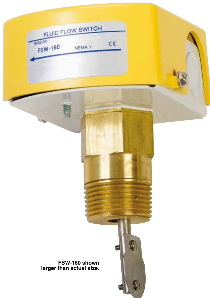
FSW-160 shown larger than actual size.

The TRODEX® FSW-160 is the newest heavy-duty line of flow switches. The switch is used to signal, start, or stop electronically operated equipment when flow or no-flow conditions occur.