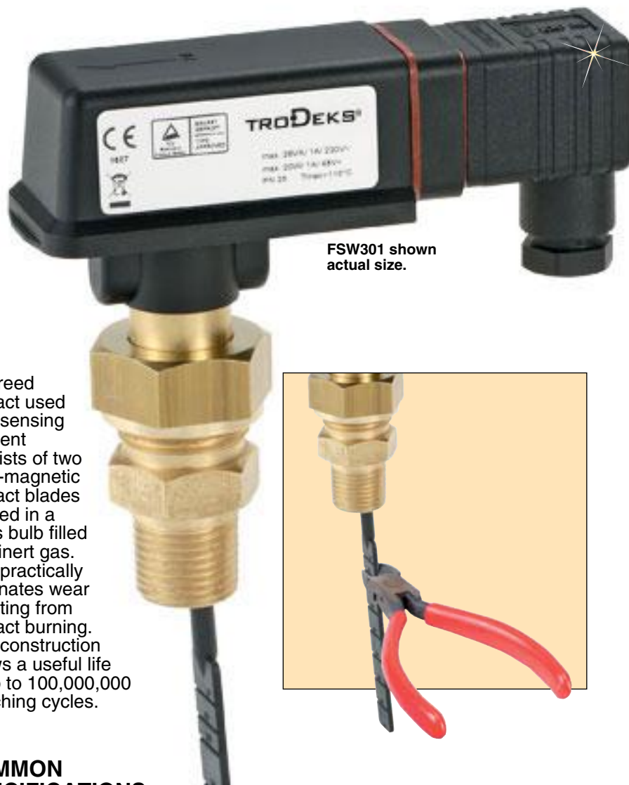
FSW301 shown actual size.

Ordering Example: FSW301, insertion style flow switch and 70A-2, fast pulse tone alarm.