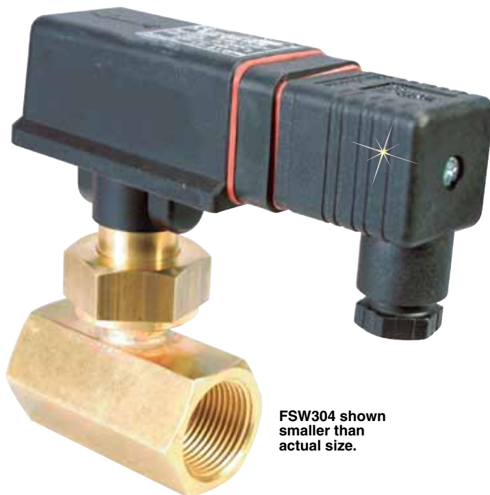
FSW304 shown smaller than actual size.

Material of Construction: Brass body, pipe section and paddle system