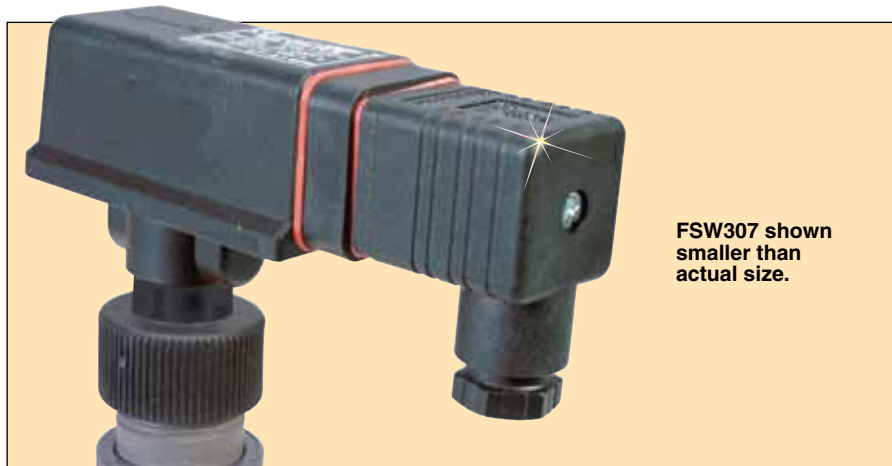
FSW307 shown smaller than actual size.