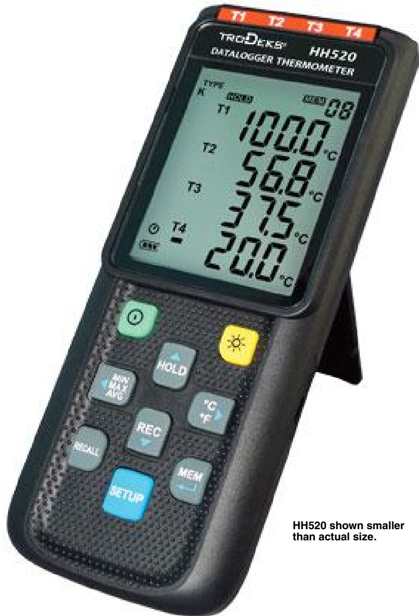
HH520 shown smaller than actual size.

The HH520 is a 4 channel handheld data logger/thermometer that accepts Types J, K, T and E thermocouples. Measurement settings and results are shown on the backlit LCD display. Data can be stored in the data logger and then downloaded to the computer or directly saved on the computer through the USB interface in real time. With the exclusive software, recording/