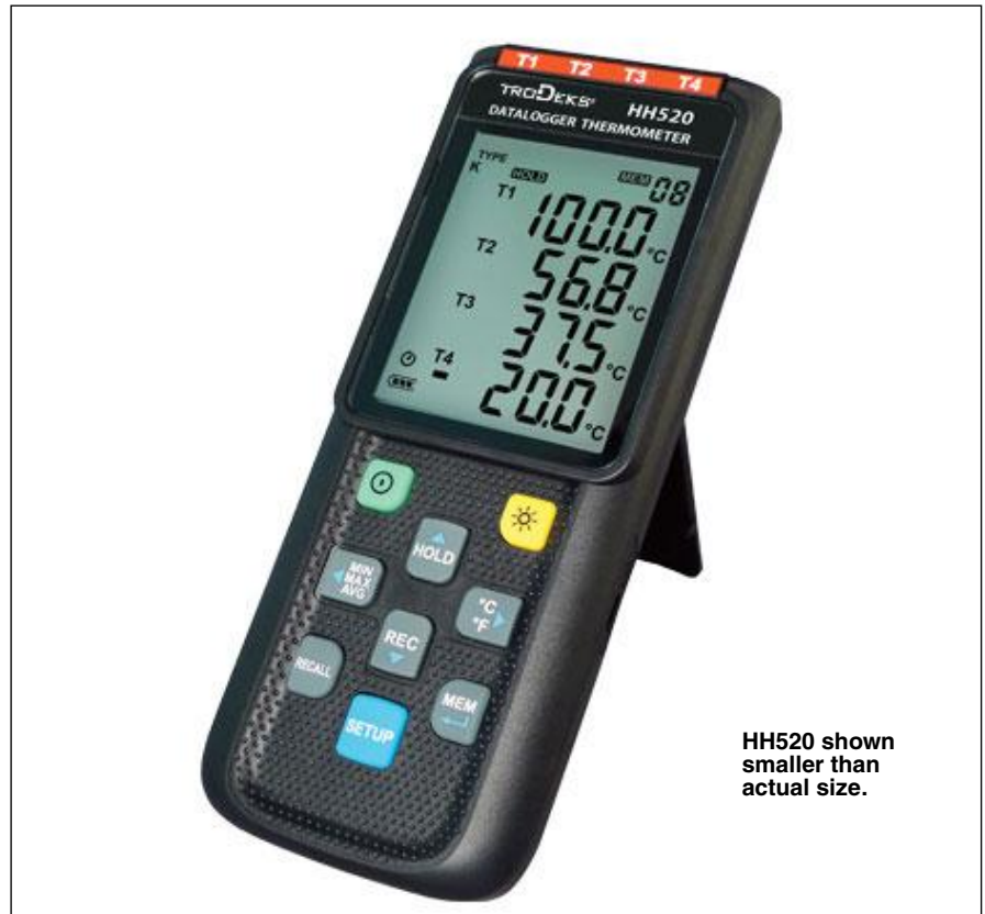
HH520 shown smaller than actual size.