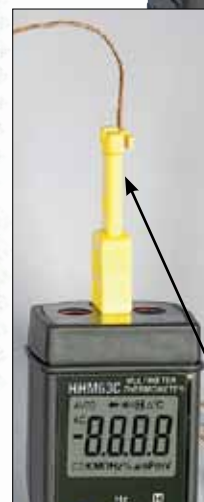
Comes with beaded Type K thermocouple.