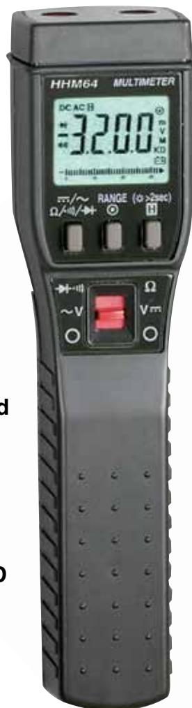
HHM64 Stick Type Multimeter 3200 count resolution Analog bargraph function Backlit LCD display DCV accuracy: 0.25%

All models shown slightly smaller than actual size.