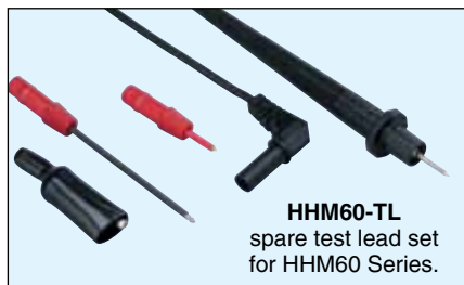
HHM60-TL spare test lead set for HHM60 Series.