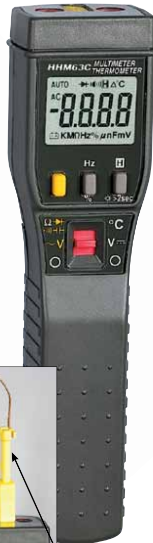
HHM63C/HHM63F Multimeter Thermometer 2500 count resolution W/microprocessor-based DMM DCV accuracy: 0.25% Resistance accuracy: 0.3% Backlit LCD display Frequency accuracy up to ± 0.05% Frequency resolution up to 0.001 Hz Type K input Temp. accuracy ± 2%