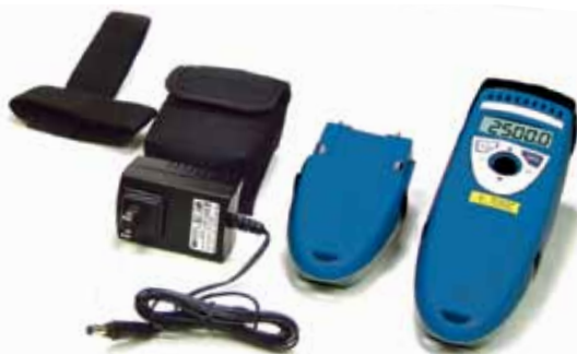
HHT41B-PAK includes strobe, 2 batteries, 115 Vac charger and holster.

Comes complete with NIST calibration certificate and operator's manual.