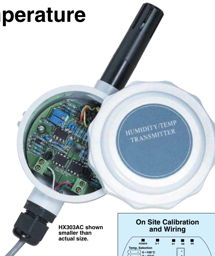
HX303AC shown smaller than actual size.