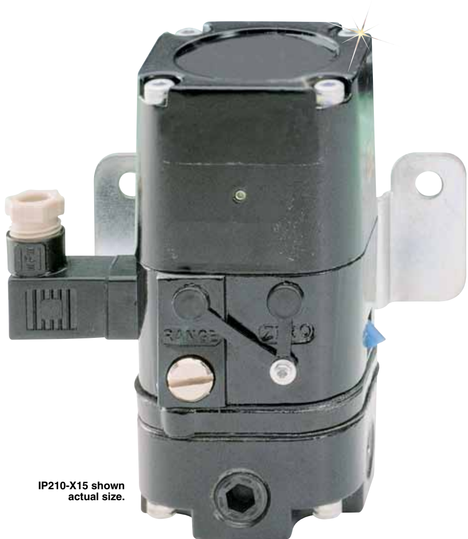
IP210-X15 shown actual size.

A “current to pressure” converter (I/P) converts an analog signal (4 to 20 mA) to a proportional linear pneumatic output (3 to 15 psig). Its purpose is to translate the analog output from a control system into a precise, repeatable pressure value to control pneumatic actuators/operators, pneumatic valves, dampers, vanes, etc. The IP210 is a loop-powered instrument, which eliminates the need for an external power supply (except for IP210-X120).