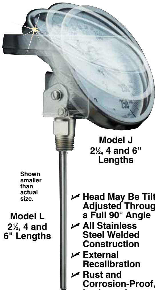
Model J 2½, 4 and 6" Lengths