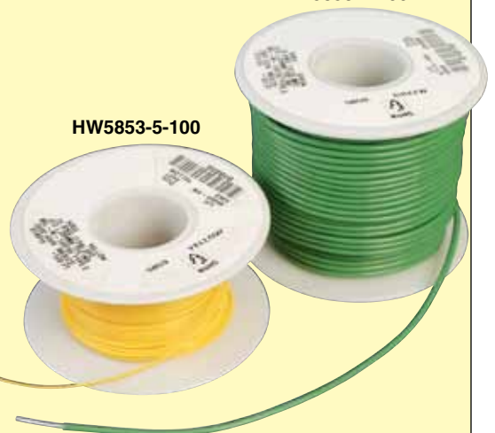
Both models shown smaller than actual size.