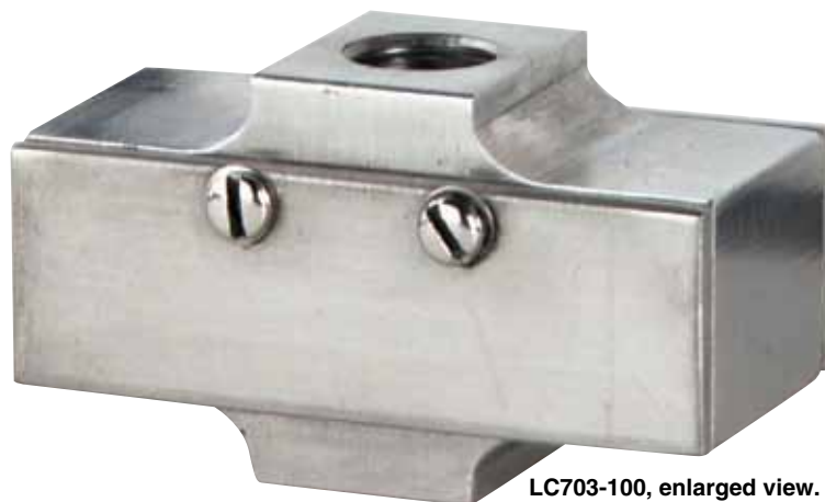
LC703-100, enlarged view.