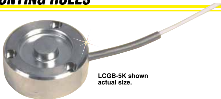
LCGB-5K shown actual size.

The LCGB Series comprises miniature low-profile compression load cells with excellent long-term stability. An all stainless steel construction ensures reliability in harsh industrial environments. These cells are designed to be mounted on a flat surface using cap screws to secure them to the base. A load button is integral to their basic construction for even force distribution.