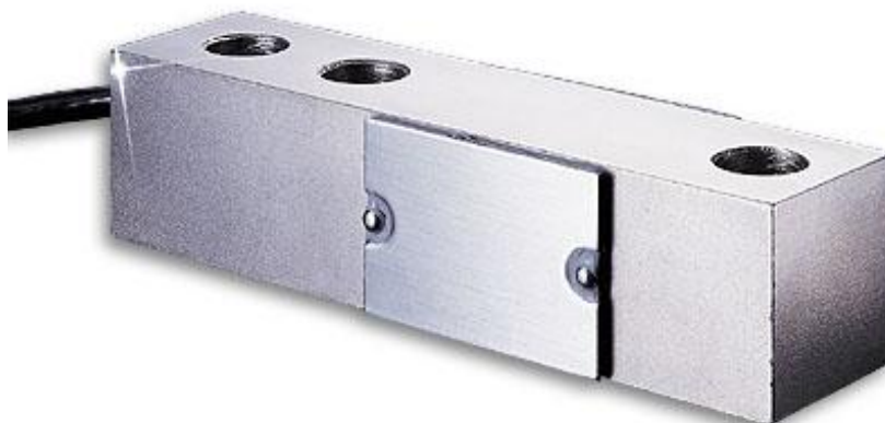
LCJA-500, with MFP mounting plate, sold separately, see "To Order" table below, shown close to actual size.