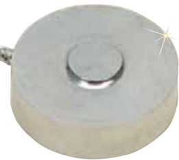
LCKD-100, shown larger than actual size.

5-Point NIST-Traceable Calibration Provided