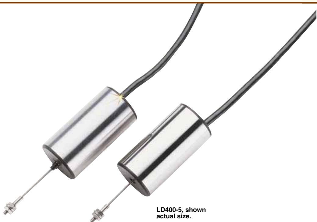
LD400-5, shown actual size.

These transducers use a precision linear variable differential transformer as the measuring source, along with hybrid ICs, including an oscillator, demodulator, and filter. Together, they make up a self-contained unit that accepts DC input and provides DC output relative to armature position. The unit's high linearity and low mass of moving parts are ideal for applications in civil, mechanical, chemical, and production engineering.