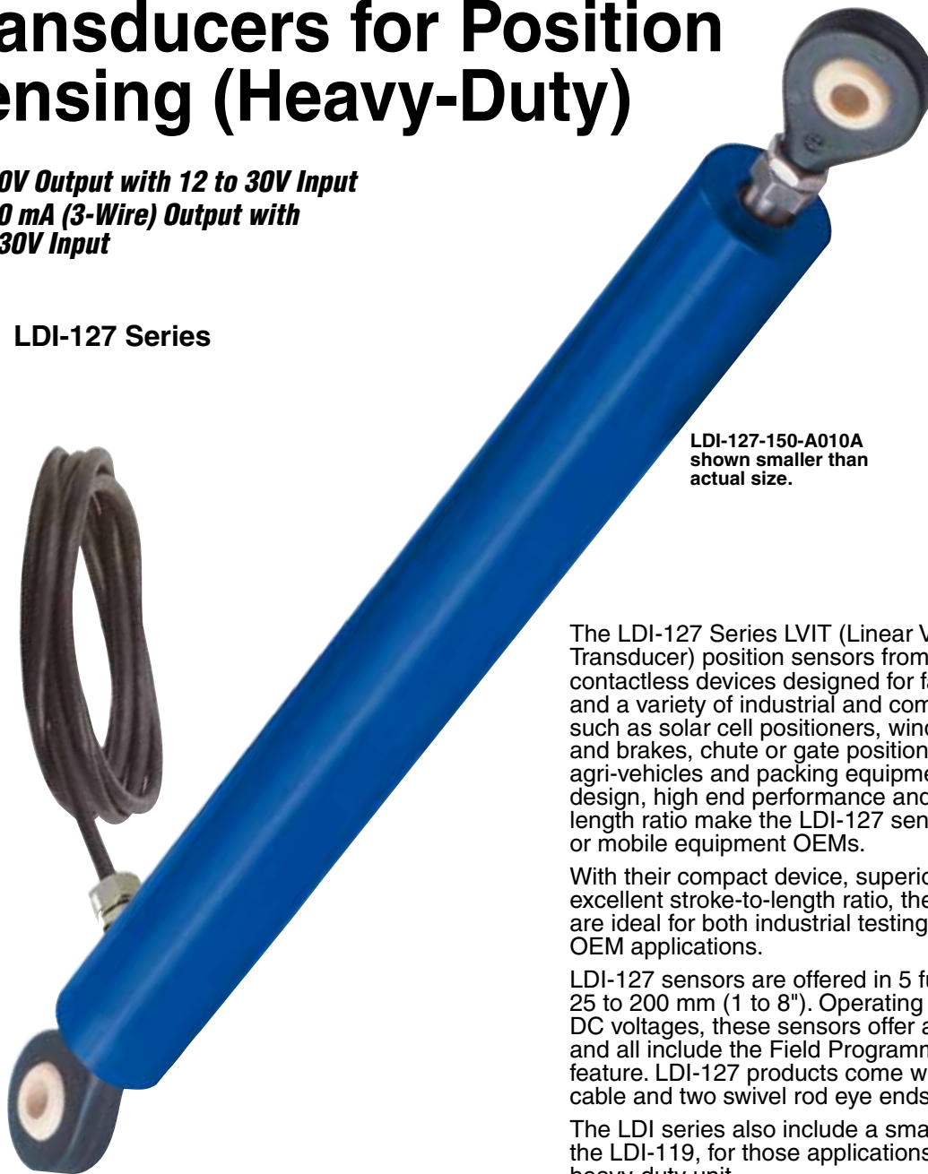
LDI-127-150-A010A shown smaller than actual size.

The LDI-127 Series LVIT (Linear Variable Inductive Transducer) position sensors from TRODEX® are contactless devices designed for factory automation and a variety of industrial and commercial applications such as solar cell positioners, wind turbine prop pitch and brakes, chute or gate positions on off-road or agri-vehicles and packing equipment. The modular design, high end performance and excellent stroke-to-length ratio make the LDI-127 sensors ideal for in-plant or mobile equipment OEMs.