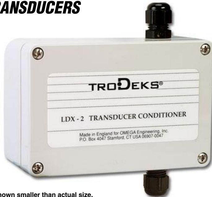
LDX-2, shown smaller than actual size.