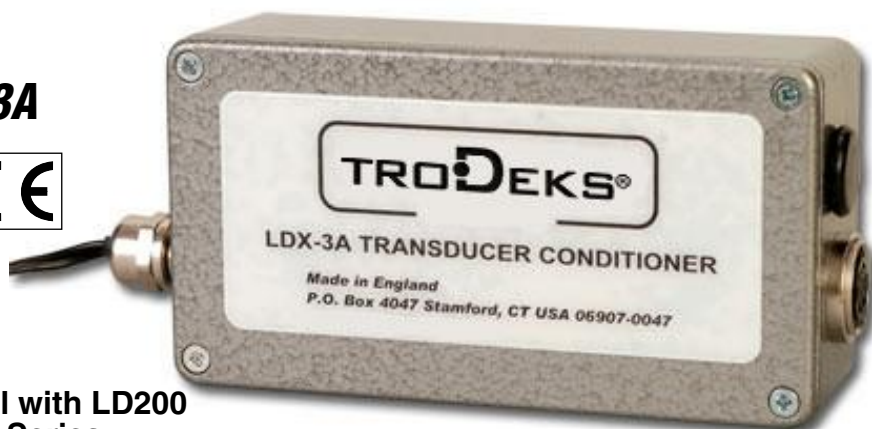
LDX-3A, shown smaller than actual size.