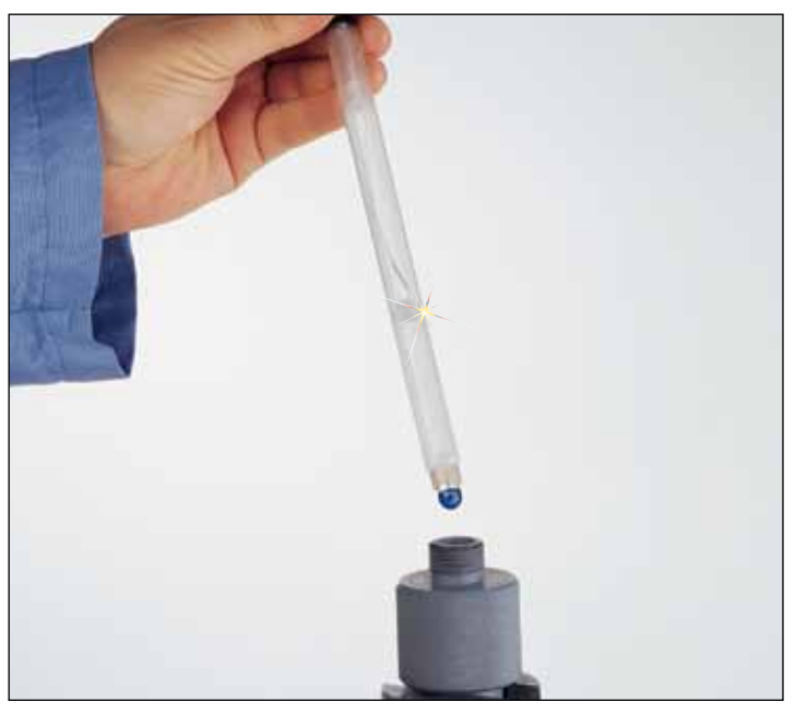
Electrode can be easily replaced or re-calibrated without interfering with the process.