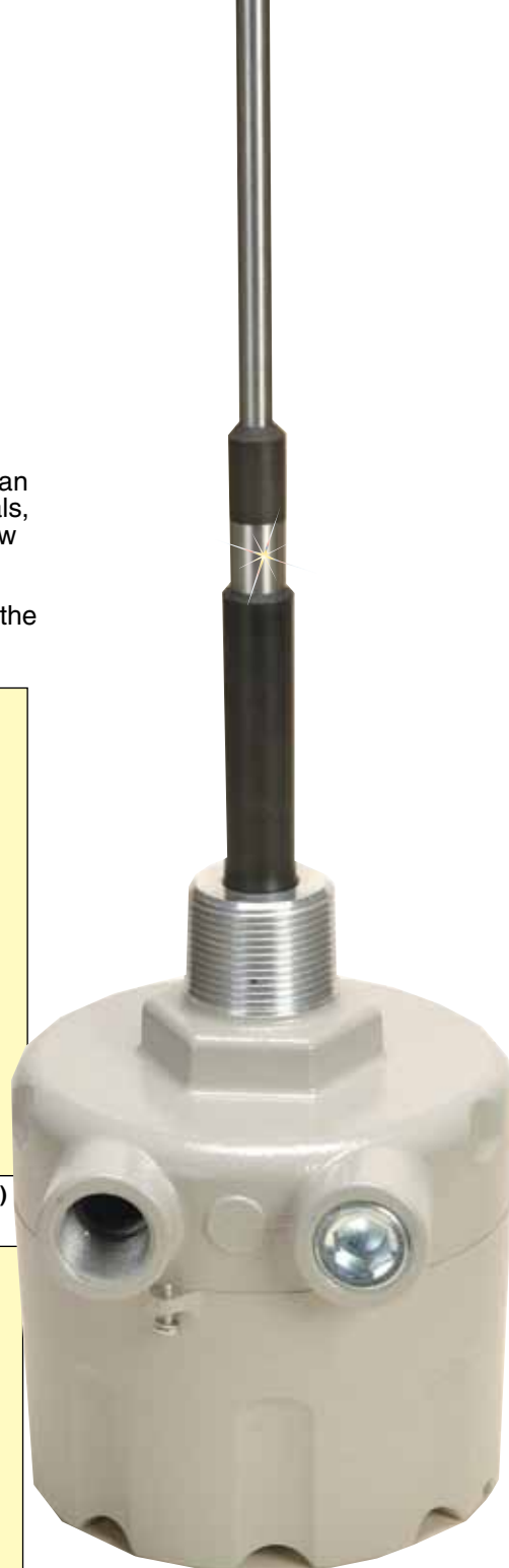
LV801, shown smaller than actual size.