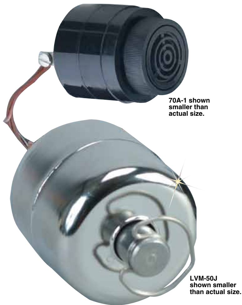
70A-1 shown smaller than actual size.