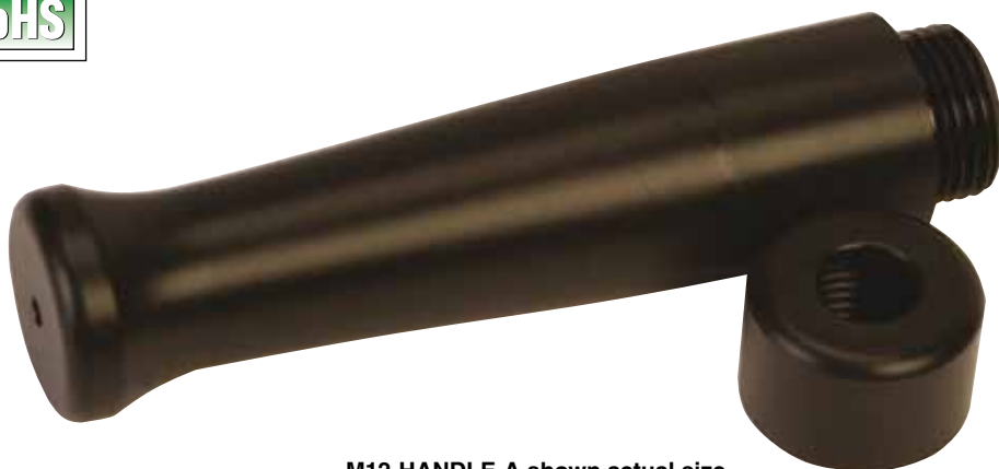
M12-HANDLE-A shown actual size.

TRODEX's heavy-duty M12 probe handle provides a fast, easily connected system of handheld probes for a broad range of applications. Sensing elements can be quickly changed or replaced in the field without tools. The M12 probe slides through the handle allowing the connector to be exposed at the end. Handles are compatible with TH-21A Series thermistors, PR-21A and PR-25AP Series RTDs and M12 Series thermocouples. Example: M12KIN-1/4-U-12-A, see accessory chart.