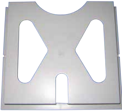
OM-AMPRINTPOCKET , print pocket with adhesive tape.

Ordering Examples: OM-AM363012L , wall mount fiberglass enclosure with twist latches, 36 H x 30 W x 12" D. OM-AM603612L , wall mount cover fiberglass twist latches, 60 H x 36 W x 12" D, and OM-P6036CS , steel sub-panel for 60 x 36" enclosure.