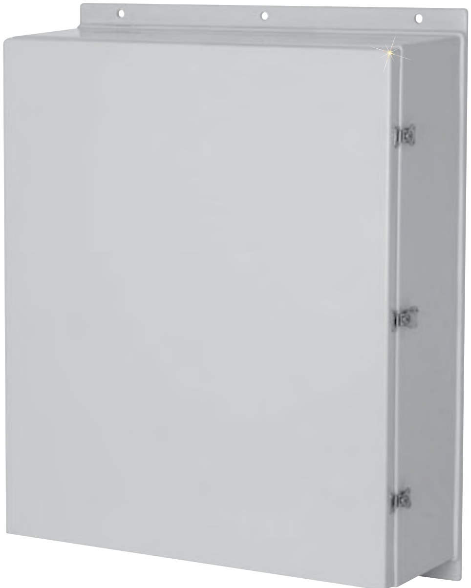
OM-AM363012L, NEMA 4X (IP66) fiberglass enclosure with stainless steel hinge and twist-latches shown smaller than actual size.