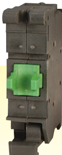
Green = normally open.