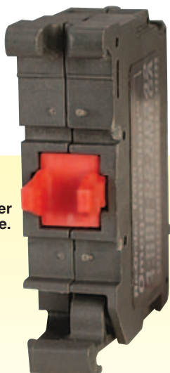
Red = normally closed.