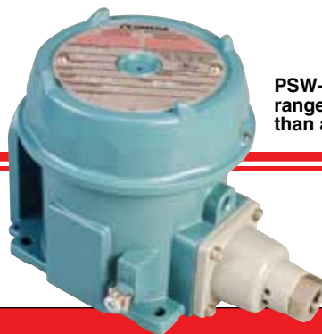
PSW-707, 0 to 500 psi range, shown smaller than actual size