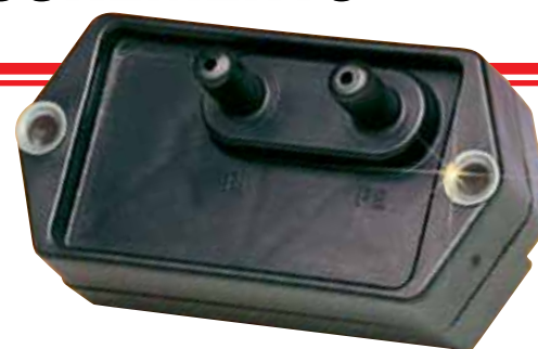
PX142-015D5V, shown actual size.