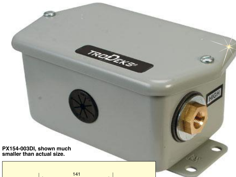
PX154-003DI, shown much smaller than actual size.