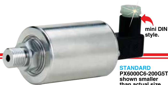
STANDARD PX6000C6-200G5T, shown smaller than actual size.