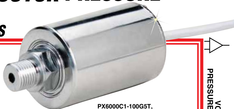
PX6000C1-100G5T, shown actual size.