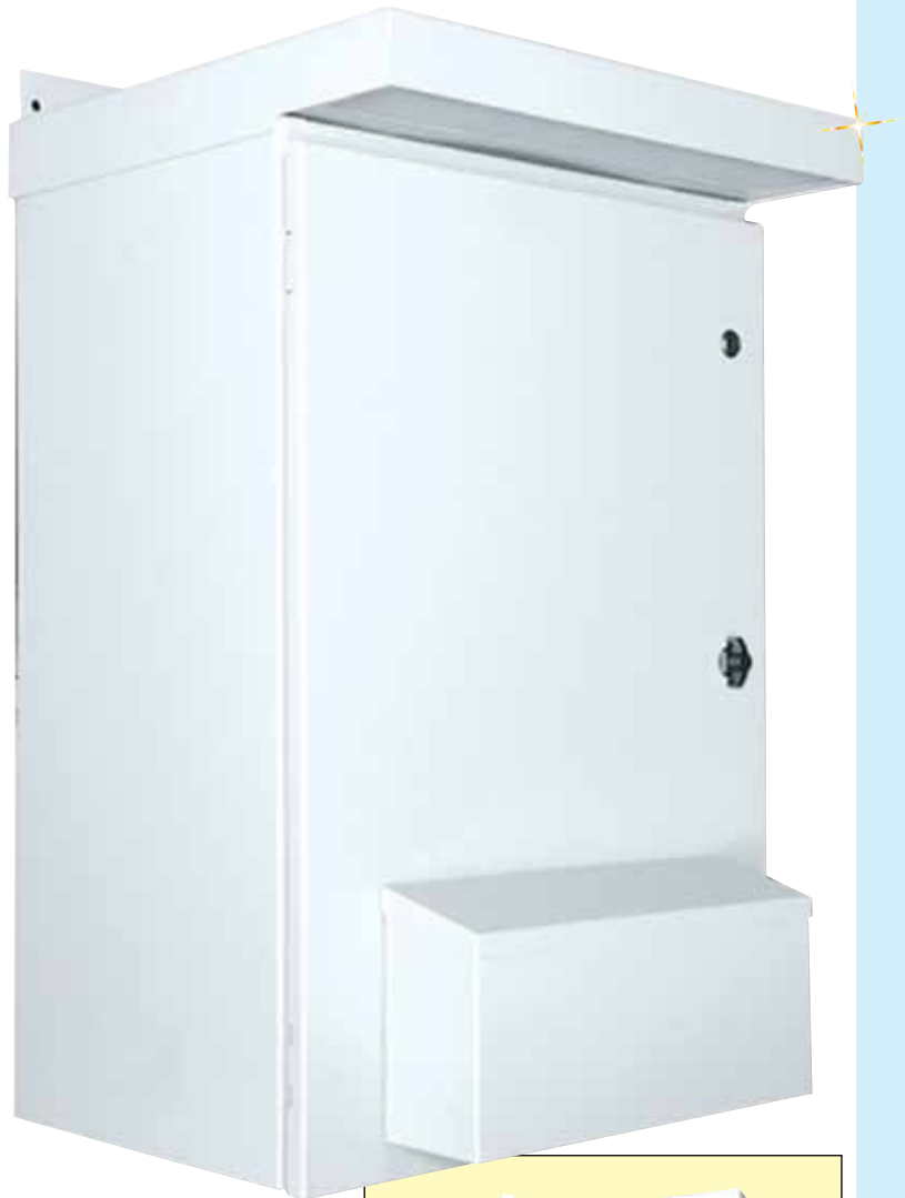
SCE-29VR2412, NEMA 3R outdoor vented enclosure with fan shown much smaller than actual size.

Finish: White powder coating inside and out; optional panels are powder coated white