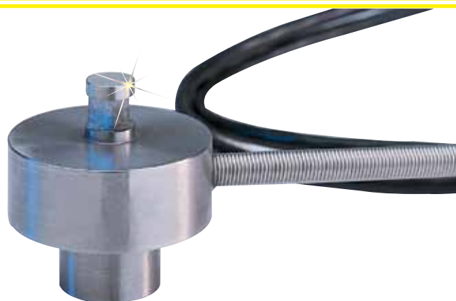
TQ201-100 shown actual size.

Electrical: 1.5 m (5') 4-conductor shielded PVC cable with strain relief